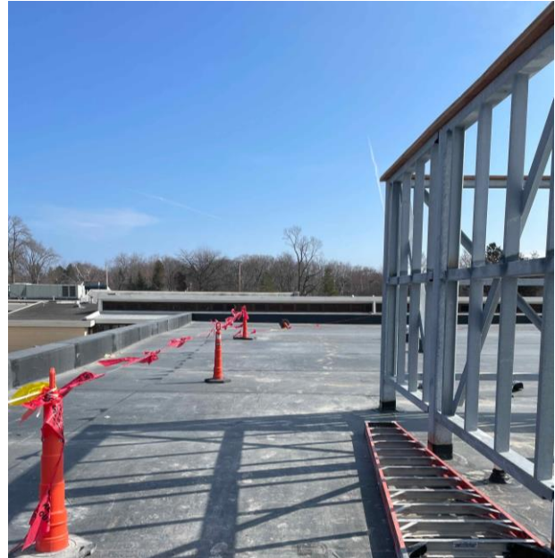
Final roofing areas were completed this month.