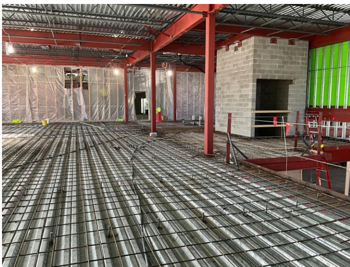
Steel reinforcement for last second floor concrete deck pour.